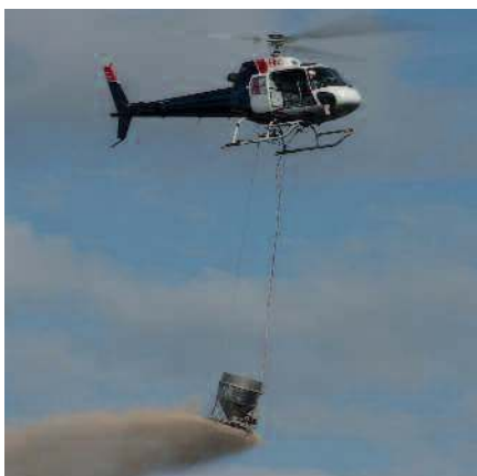
Cargo swing system