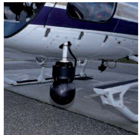
Camera with real time data link